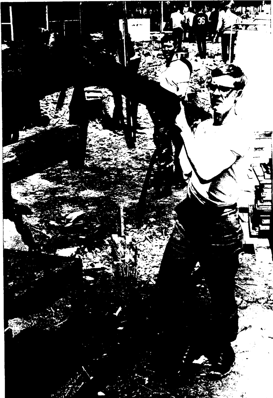
FIREWOOD FOR THE KIDS - A Marine from VMFA-232 loads wood onto a truck at the old site of the Shinsei-Gakuen orphanage in Hiroshima. The wood will be used as firewood at the orphanages new site 22 miles north of Hiroshima.